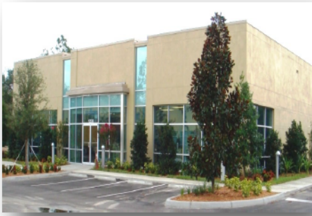
TMI's Flagship Laboratory in Temple Terrace, FL

With TMI's Onsite Technical Services you now have a system to control calibration/repair budgets, assist with audits and streamline your quality program. Call TMI to discuss our comprehensive asset management service. We will help you assess your overall equipment support needs to determine the most cost effective solution.