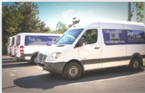
Free pick up and Delivery in Select Areas