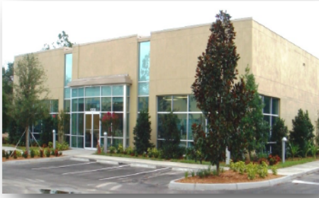
TMI's Flagship Laboratory in Temple Terrace, FL

TMI Technical Maintenance Incorporated Calibration Laboratories